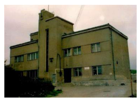
Fig. 4 The Bio-oceanographic Institute, Constanța (1932)