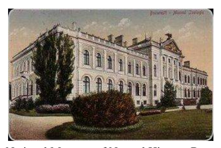
Fig. 3 The National Museum of Natural History, Bucarest (1900)