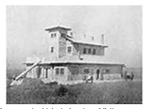
Fig. 6 The former marine biological station of Caliacra, currently in ruins.